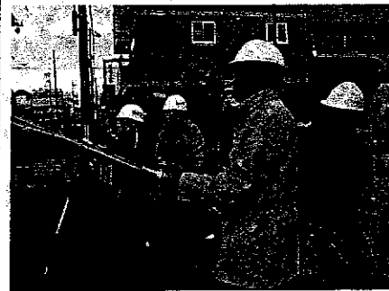
Community organization implementing a fire extinguish drill